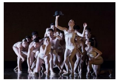
More from "CHAPLIN"